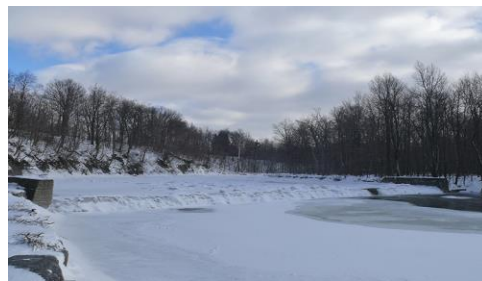
Frozen Hurd & Briggs Dam