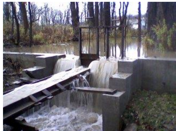
The mill race by the saw mill October 2012

Please remember to drop off your torn and worn flags for proper disposal at the Town Hall or in the box on the porch at the museum